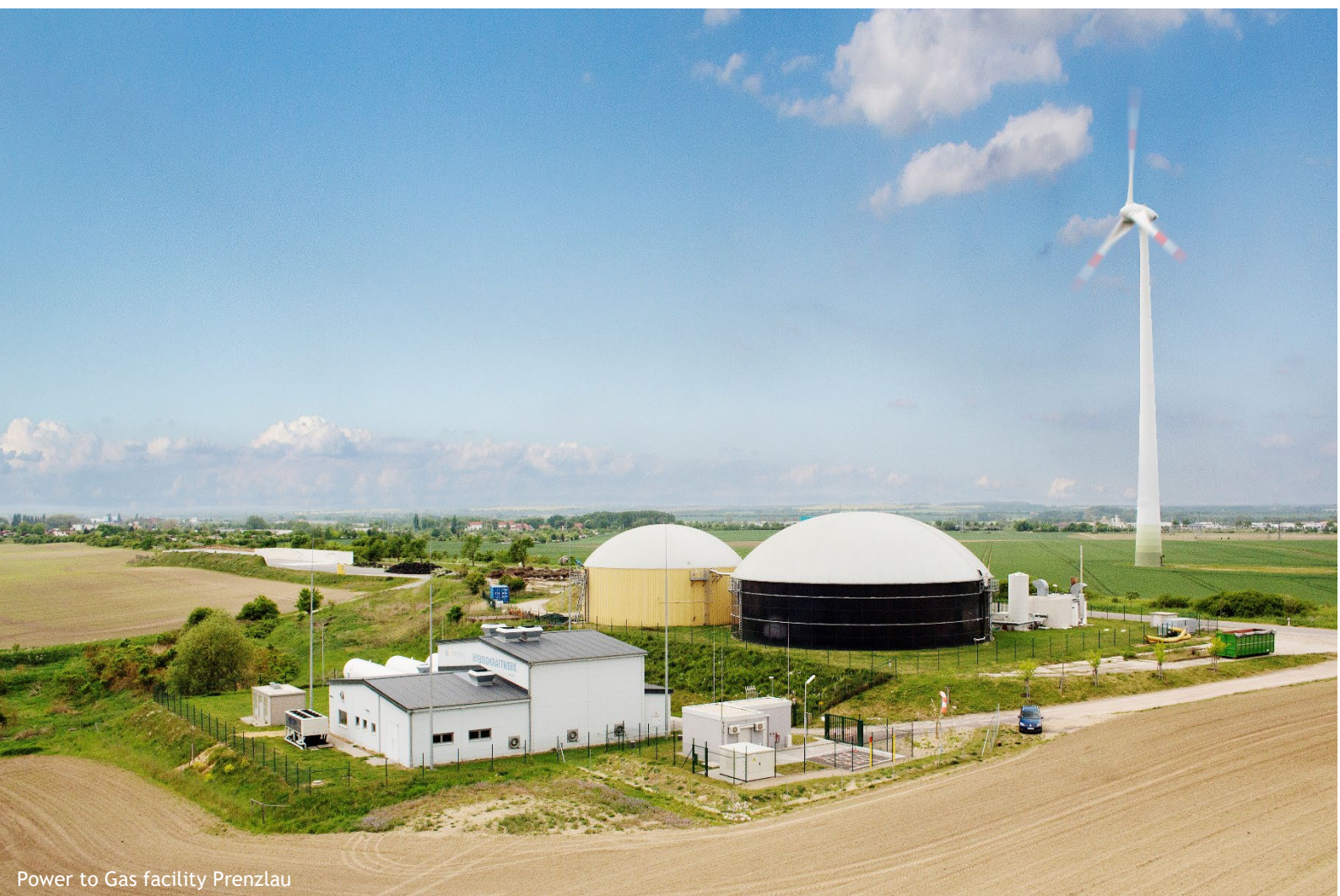
Power to Gas facility Prenzlau